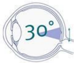
Conventional Exams (without dilation)

This non-invasive procedure becomes a permanent part of your medical file, enabling the doctors to make important annual comparisons when monitoring your eye health.